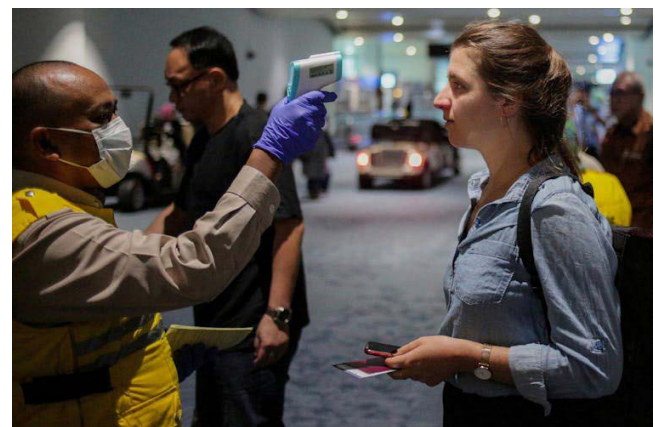
Indonesia began screening travelers after an mpox case was reported in Singapore in May 2019.