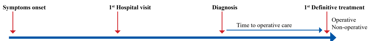
Figure 1: Pathway to BCA care

There are sentinel stages along the BCA pathway to care, including the first symptom, first healthcare visit, diagnosis and first definitive (operative or non-operative) treatment, and the time between these can be measured (Figure 1). Various factors can contribute to delays in getting the first definitive care, and these factors could range from patient