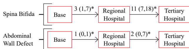
Figure 2: Comparing time intervals between cases of SB and AWD