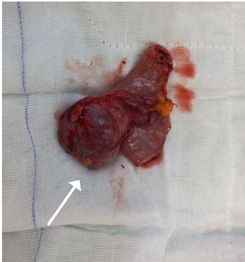
Figure 2: Specimen photograph demonstrating resected small bowel mass (white arrow)

the third postoperative day. He was planned for follow-up at the surgical outpatient department for clinical review and histology results in one week.