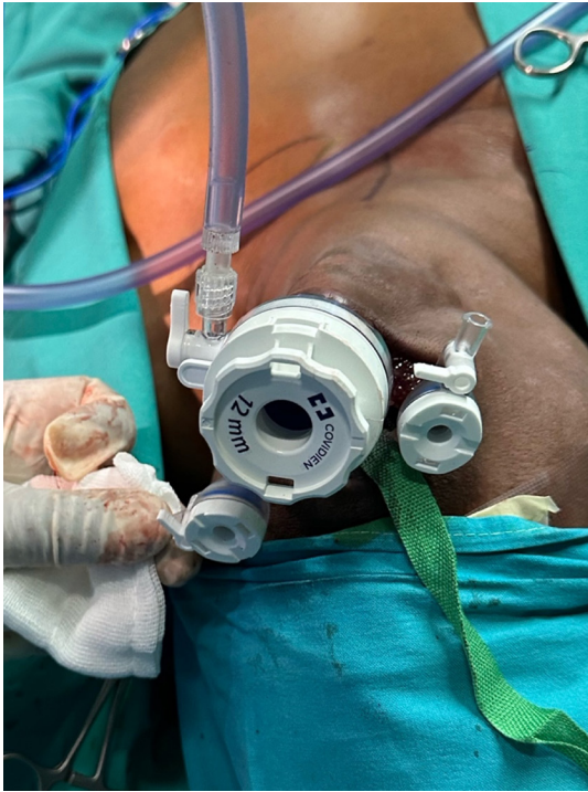
Figure 1: Port position; in this picture a 12 mm port was used instead of a 10 mm because of a shortage of ports

gas is inflated at a pressure of 8 mmHg. The 5 mm ports are inserted under vision. Dissection continues in the subplatysmal plane until the sternal notch. Strap muscles are divided and retracted laterally using a nylon 3/0.