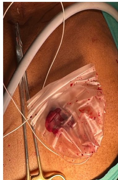
Figure 3: Retrieved specimen

The mean length of hospital stay was 24 hours. All the TOETVA cases were carried out successfully with no need for conversion to conventional approach. In all the cases, the RLN and parathyroids were identified and preserved. The mean operative time was 210 minutes. No drains were used. No surgical complications were noted, including recurrent laryngeal nerve injuries. No bleeding, seroma, infection or need for reoperation was noted. No mental nerve injury