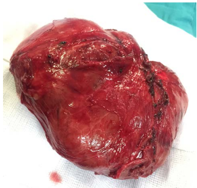
Figure 3: Specimen of the anterior mediastinal goitre weighing 522 g and measuring 123 x 94 x 45 mm that caused significant cardiorespiratory symptoms

During embryology, the descent of the thyroid gland and the inferior parathyroid glands from the third pouch can arrest at any level in their course. The undescended lingual thyroid is by far the most common (90%) variation. 7 Pure mediastinal goitre, arising de novo in the chest, is extremely rare. 8 Embryologically, it may represent the type 4 thyroid