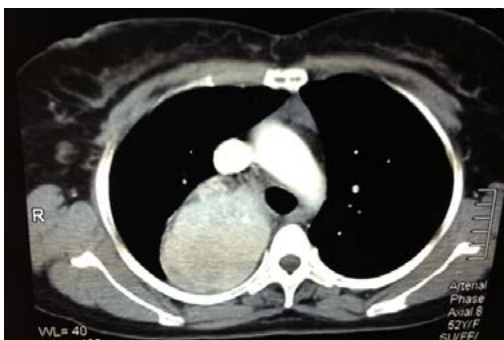
Figure 2: CT scan of posterosuperior mediastinal goitre

(range 45–71 years). The patient and goitre characteristics are depicted in Table II, while patient outcomes are depicted in Table III.