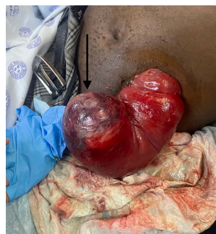
Figure 2a: Prolapsed erythematous stoma with signs of ulceration (black arrow)