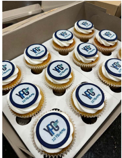
PSSA History Book Celebration Event