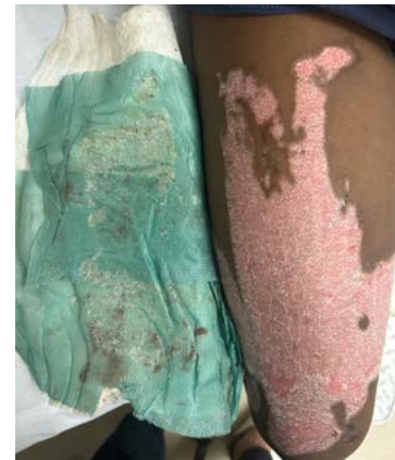
Figure 4: Complete epithelialisation of a superficial partial-thickness burn after easy removal of Cutimed® Sorbact®

We believe that superficial partial burn and donor site wounds are unique and do not behave like other acute or chronic wounds, warranting a unique approach. Choosing a dressing with an antimicrobial effect to prevent infection and minimise trauma at the wound-dressing interface by an extended wear time promotes spontaneous healing of these wounds by epithelialisation. The properties of Cutimed® Sorbact® appear to achieve this goal.