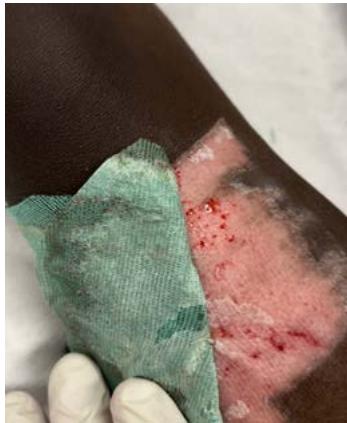
Figure 2: Premature removal of Cutimed® Sorbact® with removal of epithelial cells and bleeding