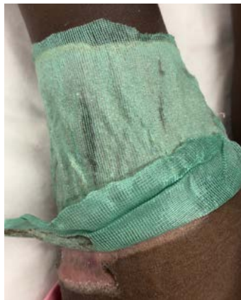
Figure 3: Dry adherent appearance of Sorbact® over the donor site